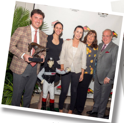
2017 Owner-of-the-Year Sagamore Farm