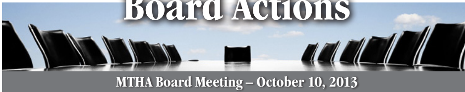
MTHA Board Meeting – October 10, 2013